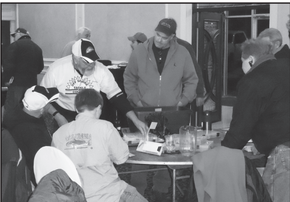
The Offshore table was very busy.