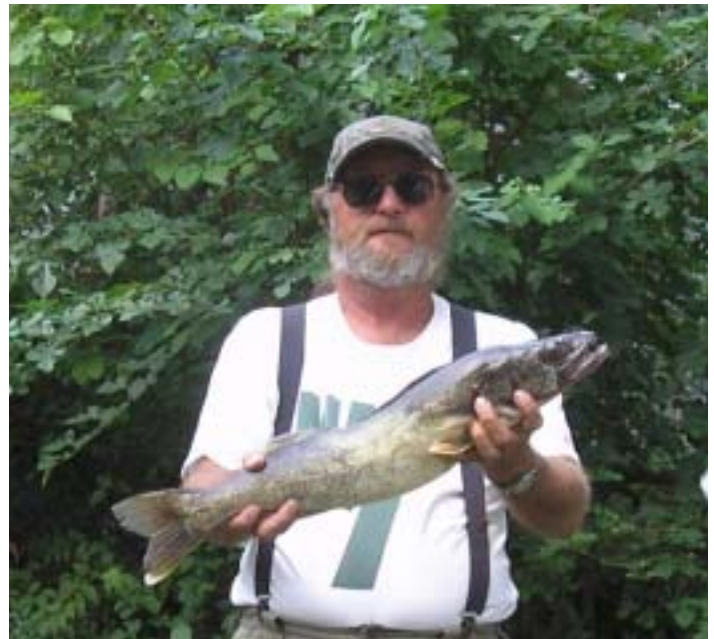
This is much better. I have stepped forward about 10 feet and it has made a big difference. The background leaves and branches are already starting to go out of focus. If you do this with your photos you will find that the person and the fish stays as the major emphasis in your picture. Only problem remaining is that a hat might shade the face and the sunglasses hide the eyes.