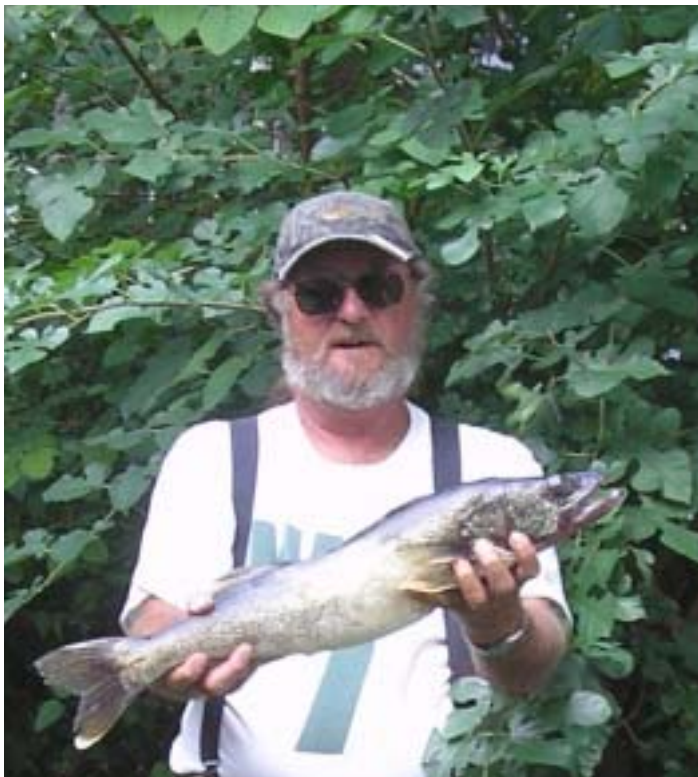
In this photo I placed myself up right up next to the background shrubs. The result is that the background starts to dominate the photo. If you do this with your photos then you will detract from the person and from the fish.

I had Loretta take several pictures of me while I was holding a larger Walleye. I did this to emphasize a few photo taking points. In one of the photos it was the background. In another photo the idea was to show what happens when a cap is too far forward or the person is wearing sunglasses. The third picture is there to show that the photo looks much better when some of the problems have been eliminated.