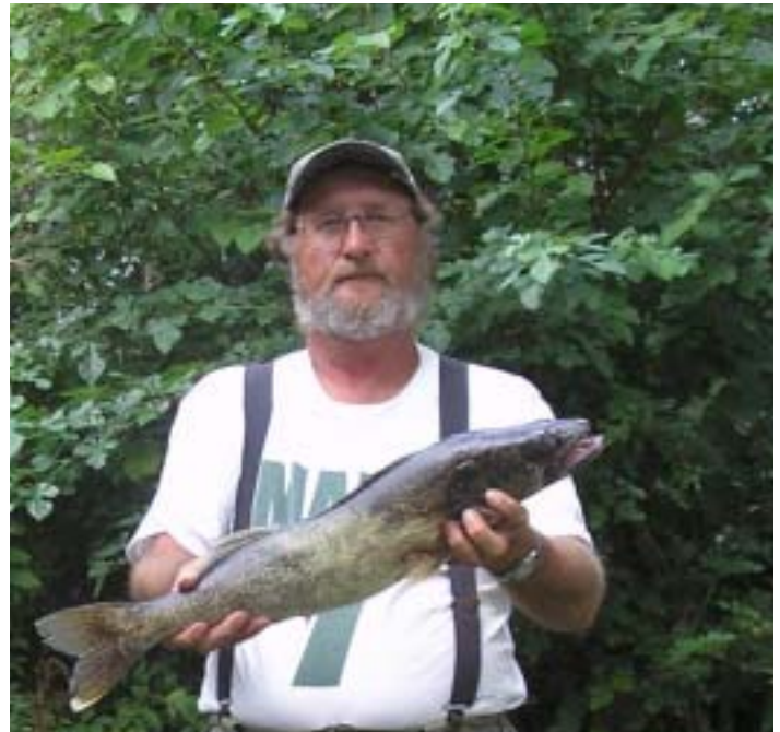
Even better. I stayed in the same spot but removed the sunglasses and positioned the hat so it did not shade my eyes. It is hard at first but try to remember the small points in each picture. Eventually they will become second nature.