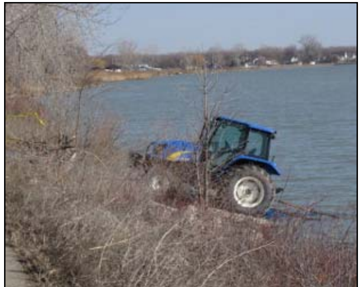
The tractor backed down into Lake St. Clair so that the pump is underwater and ready to start filling the two ponds."