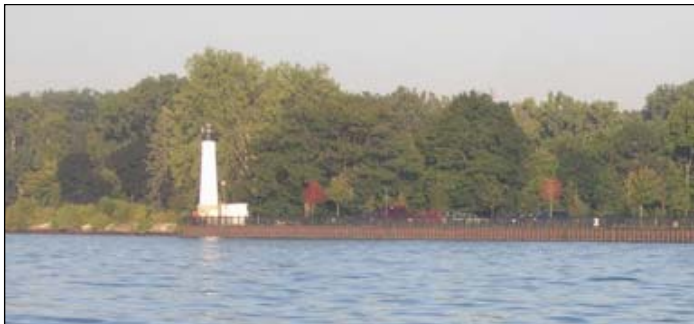
A panoramic view of the Windmill Pointe Light which is located in Mariner's Park at the foot of Alter Road. At night the light serves as a beacon for boaters and night fisherman.

In 1915 the General Aeroplane Company (GAC) was incorporated. Planes were built at a location at 1507 Jefferson and the completed craft was taken to a riverside hangar on the grounds of the Detroit Motor Boat Club. On August 28, 1918, the General Aeroplane Company ceased operations. In spite of its short life this company still has the distinction of being Detroit's first