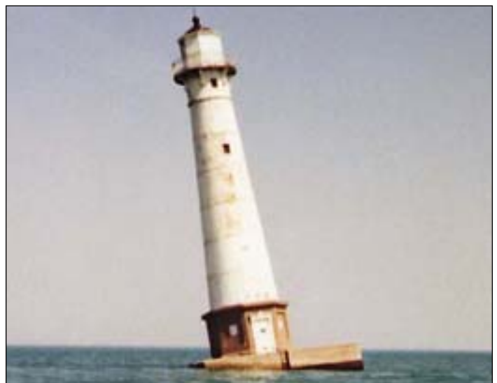
One of the original range lights in lower Lake St. Clair. It was positioned between Peche Island and Belle Isle until it was rebuilt in the mid 1980's. The original lighthouse was saved and moved to the park in Port Huron next to the Coast Guard Station.