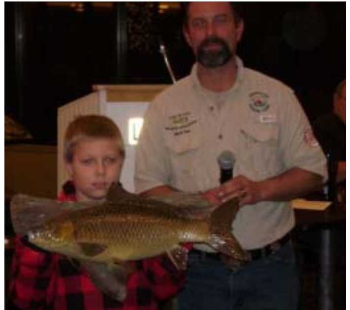
During the summer the LSCWA has a fishing outing for the kids in the community. The boy or girl who catches the biggest fish, of any kind, during the event is presented with a mount of that fish at the December membership meeting. The taxidermy work is done by St. Clair Flats Taxidermy.

It is the start of the ice fishing season so this month the raffle table will have ice fishing equipment. The main item on the table will be a Big Buddy heater. This will be perfect to keep you warm when you are slamming the big perch this year.