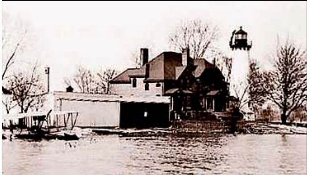
"The General Aeroplane Co. hangar at the Detroit Motor Boat Club. The location was south of Riverside St. just west of Alter Road on the Detroit River. This picture was taken after successful flight testing, in May of 1916. The altered lighthouse still stands, the barn, hangar and house area became a trailer park. The trailer park was removed in the 1990s and the land is now vacant."

Some of the interesting points in the history