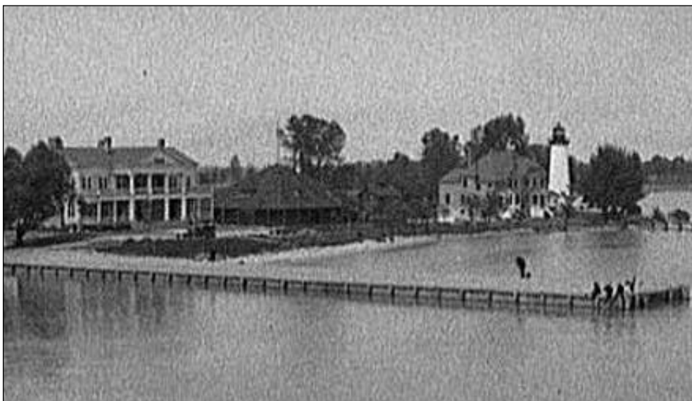
An old aerial photo showing the lighthouse when it was near the early 1900s boat club. The smaller house next to the lighthouse was for the lightkeeper and his assistants.