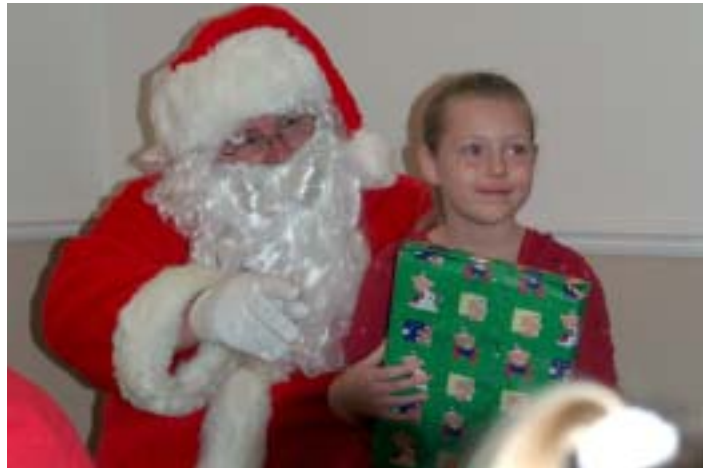
Santa, toys, snacks and a lot of happy smiles make the Kid's Christmas Party a must attend event.