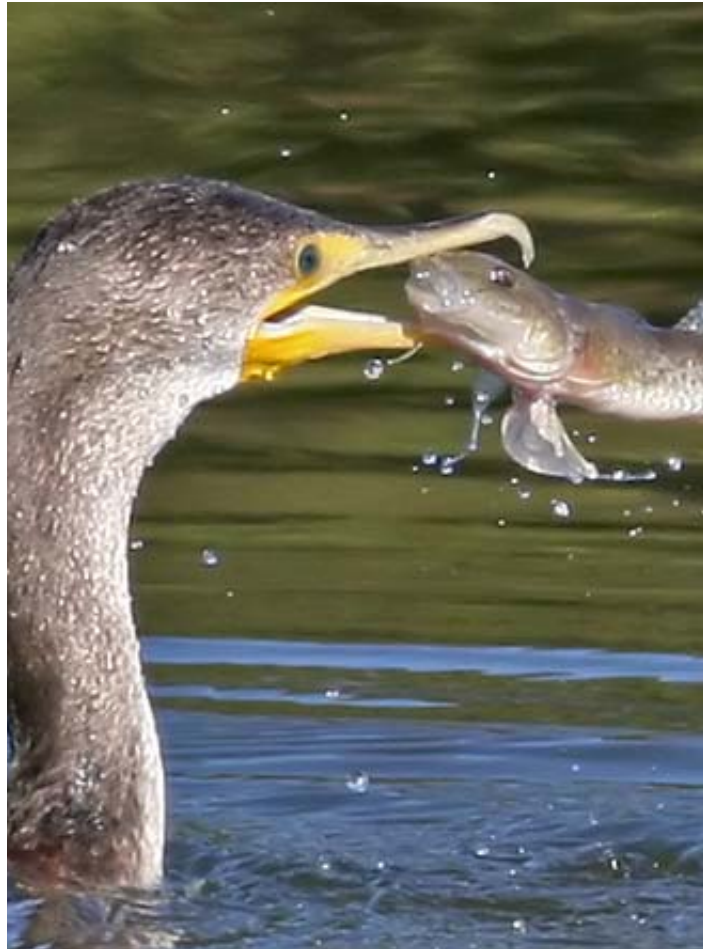
"As a reminder the July guest speaker will be talking about cormorants. The picture was found on his photo albums on the website: http://www.pbase.com/rfredrick/cormorants "